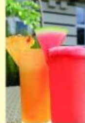
1 for 1 on Fresh Juices Available at The Salon and Tisettanta Lounge

Available daily at The Salon and Tisettanta Lounge from 1 - 31 December 2017. For reservations and inquiries, contact The Salon at 6799 8809 or fnb@hfcsingapore