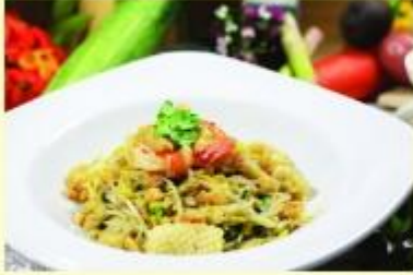
Enjoy Singapore Hokkien Mee $10+ Available for dine-in at The Salon